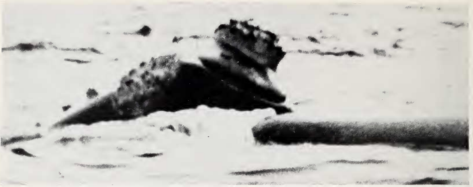
Fig. 6. A whale rests its lower jaw upon the submerged head of its partner.

times rolled it completely over. On occasion, this activity ceased with the head of the initiating whale resting on the dorsal surface of the passive partner (Fig. 6). There were many variations, for example, when the initiating animal thrust directly at the flank of the passive partner or when it slid slowly beneath the ventral surface, sometimes inverting as it did so. Further, the angle of approach varied, and contact was established at different points along the axis of the body of the passive whale.